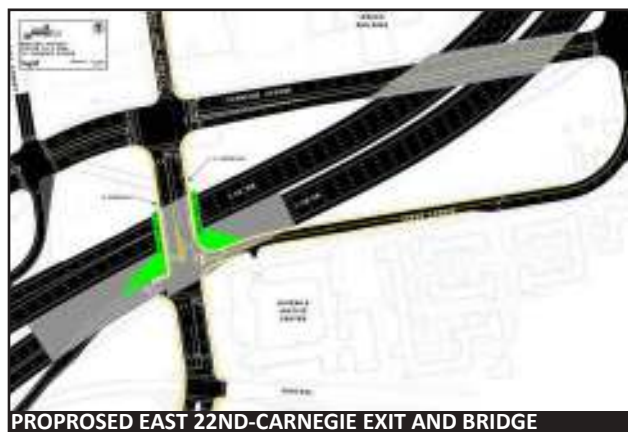
PROPOSED EAST 22ND-CARNEGIE EXIT AND BRIDGE

Looking further down the complex infrastructure development road, the CDI team enabled the end of seven years of friction and failed negotiations with the Ohio Department of Transportation and neighboring Midtown Cleveland regarding proposed exit changes to the Innerbelt. Working collaboratively with CDI and Midtown, ODOT District 12 created a new solution with a planned East 22nd Street/Carnegie Avenue exit that will connect Carnegie