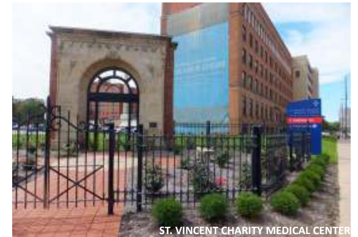
ST. VINCENT CHARITY MEDICAL CENTER

These efforts dovetail with a host of unprecedented private investment that flowed into the district throughout the year. The Woda Group purchased the 1917 Stuyvesant Motor Company Building on Prospect Avenue. Plans for up to 40 market-rate apartments are slated for the former City Blue building via a $7 million renovation, funded in part by a coveted Ohio historic-preservation tax credit. Further to the north, Global X snapped up several properties along the Superior corridor, including the iconic 1917 ArtCraft Building . In addition, student housing developers Asset Plus purchased the former Heritage Hall (the 1911 YMCA building on Prospect) renaming it The Domain . Renovation plans are in the works. Details on all of these projects are expected in early 2016.