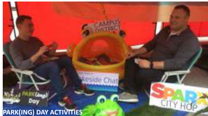
PARK(ING) DAY ACTIVITIES