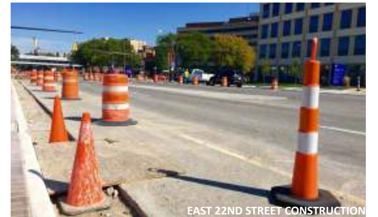
EAST 22ND STREET CONSTRUCTION

Improvements will include new pavement; curb, drainage and sidewalk work; median improvements and new traffic signals. Upgrades will also include new streetscape elements such as signage, benches, brick pavers, bike racks, trash receptacles, plantings and unique public art by Augustus Turner that aims to represent the history of the Central neighborhood. That history is so voluminous and rich, CDI has committed to expand Turner's concept and raise funding for a future public art piece for East 30th Street. When the East 22nd Street improvements are in place, the walk or bike ride between the district's three anchors will be significantly friendlier and our Main Street will finally be worthy of its title.