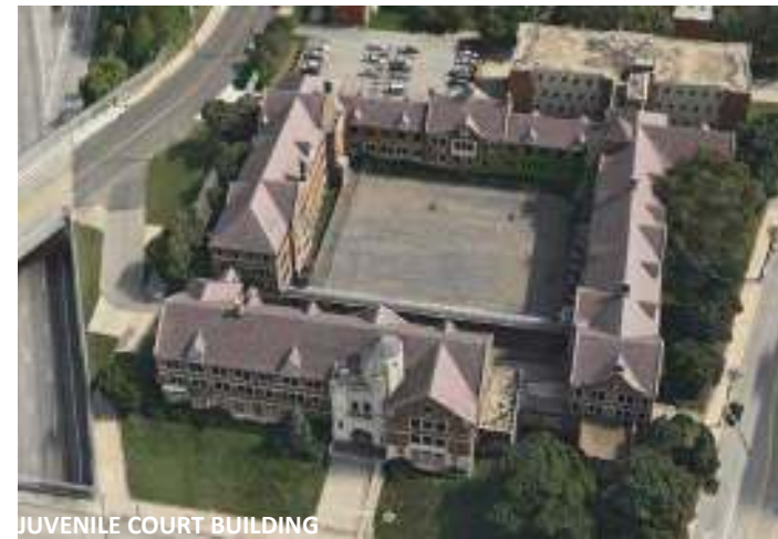
JUVENILE COURT BUILDING

The Campus District is home to a fascinating collection of historic structures that have endured for decades amid the changing faces of our neighborhoods. From social service and religious structures in the central and southern portions of the district to the industrial grand dames that dot the Superior Arts and Lakefront Industrial Districts, the architecture we live and interact with every day defines the district as profoundly as its people. In a subtle way, our buildings represent who we were, who we are and most importantly, who we are going to be.