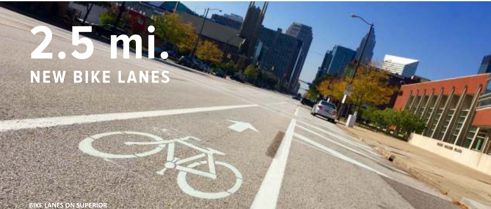
BIKE LANES ON SUPERIOR