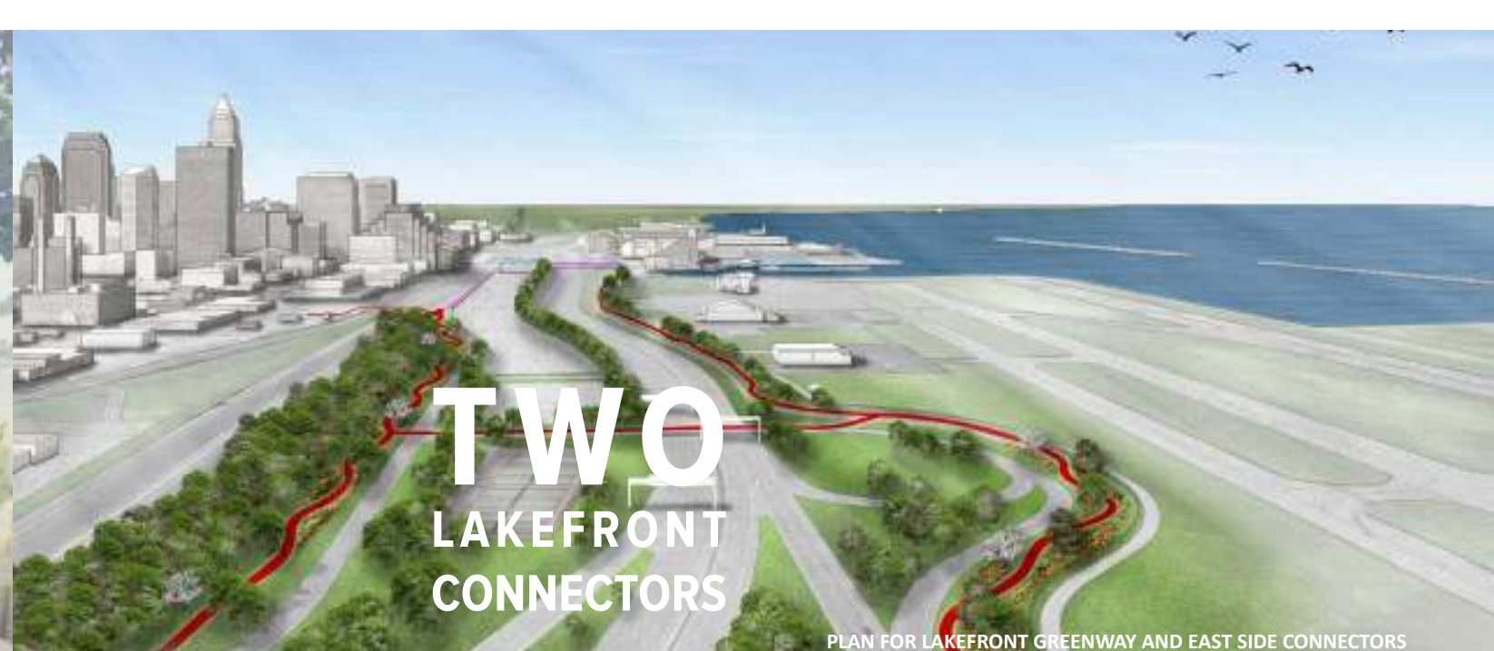
PLAN FOR LAKEFRONT GREENWAY AND EAST SIDE CONNECTORS