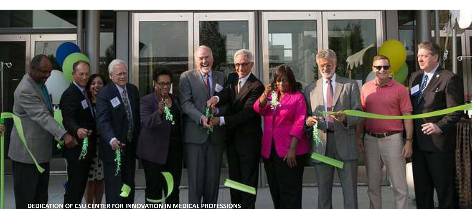
DEDICATION OF CSU CENTER FOR INNOVATION IN MEDICAL PROFESSIONS