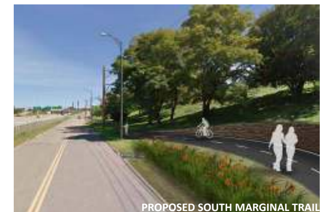
PROPOSED SOUTH MARGINAL TRAIL