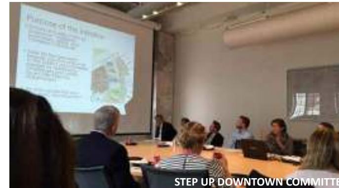
STEP UP DOWNTOWN COMMITTEE