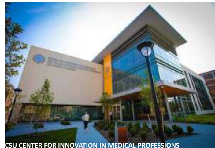
CSU CENTER FOR INNOVATION IN MEDICAL PROFESSIONS

Throughout the year, property owners, developers, stakeholders and officials planned new projects. Some moved to 2016, while others produced gleaming results such as the newest addition to one of our major anchors: Cleveland State University's $45 million Center for Innovation in Medical Professions (CIMP) building, into which students stepped this fall.