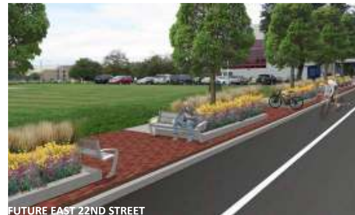
FUTURE EAST 22ND STREET

The construction boom also included the East 22nd Street Improvement Project , which stretches between Orange and Euclid Avenues. Nicknamed the district's "Main Street," East 22nd is the district's most significant north/south corridor—a designation its previous incarnation did not convey. Federal dollars allocated by the Northeast Ohio Areawide Coordinating Agency (NOACA) with a local match from the city of Cleveland funded the project, which was managed by the Ohio Department of Transportation (ODOT), District 12. First outlined through a 2010 Transportation for Livable Communities Initiative study funded by CDI and NOACA, the long-awaited effort broke ground in the summer of 2015 and will be complete in spring of 2016.