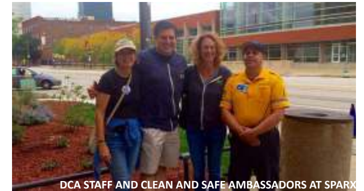
DCA STAFF AND CLEAN AND SAFE AMBASSADORS AT SPARK