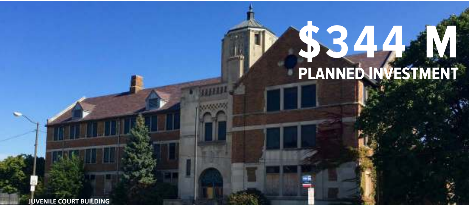
JUVENILE COURT BUILDING