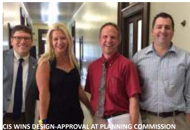
CIS WINS DESIGN-APPROVAL AT PLANNING COMMISSION