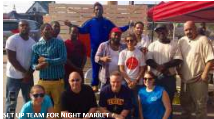
SET UP TEAM FOR NIGHT MARKET