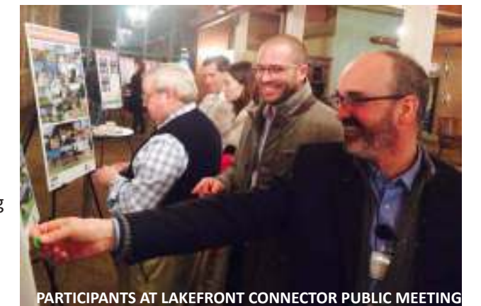
PARTICIPANTS AT LAKEFRONT CONNECTOR PUBLIC MEETING

Further to the north, the Campus District and St. Clair Superior neighborhood joined forces yet again, this time in an effort to connect both lakefront neighborhoods to Lake Erie. In 2015, working with Environmental Design Group and Michael Baker International, the two entities and a steering committee completed the Eastside Lakefront Connector Study , funded by a $75,000 NOACA 2014 Transportation for Livable Communities Initiative grant and a $20,000 match from Cleveland City Planning. The plan calls for two 10-foot-wide all-purpose trails adjacent to both North and South Marginal Roads that would connect via two existing spans over Interstate 90: the Municipal Parking Lot Bridge and the East 55th Street Bridge. Two additional bridges at East 18th and 40th Streets could connect both districts directly to the lakefront. In early 2016, CDI and the St. Clair Superior Development Corporation will present the proposal to the City Planning Commission and formulate a funding strategy.