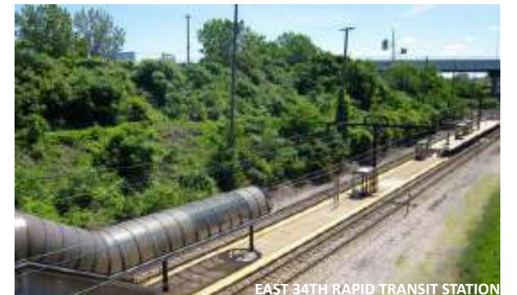
EAST 34TH RAPID TRANSIT STATION

Considering all of it this within walking distance of the Stephanie Tubbs Jones Transit Center, where the Cleveland Megabus stops, points across the Campus District are now essentially connected to the whole country.