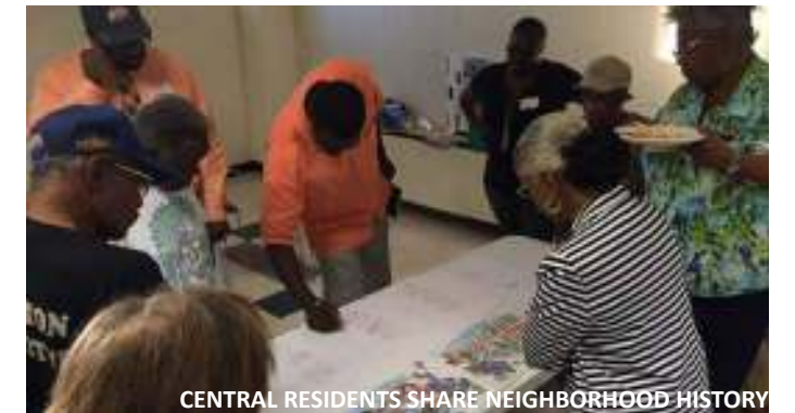
CENTRAL RESIDENTS SHARE NEIGHBORHOOD HISTORY