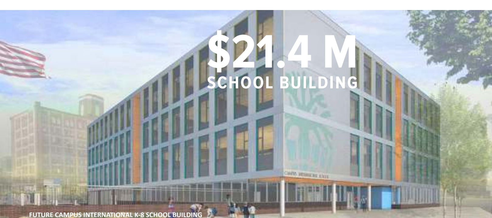
FUTURE CAMPUS INTERNATIONAL K-8 SCHOOL BUILDING