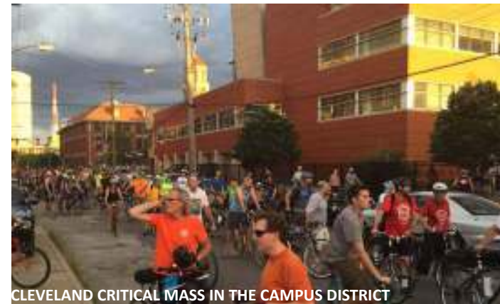
CLEVELAND CRITICAL MASS IN THE CAMPUS DISTRICT

The most visible development for the district this year was evidenced by backhoes, burly workers and closed lanes as $6 million worth of long-awaited infrastructure projects commenced. The payoff will be with three new sections of bike lane corridor : from Orange to Euclid Avenues along East 22nd Street; from East 22nd to East 55th Streets along Community College Drive and on Superior Avenue between East 18th and East 30th Streets. The network was originally conceived by a 2013 study conducted with Kent State University's Cleveland Urban Design Collaborative (CUDC) that outlined the potential for improved foot and bicycle traffic in the district. This two and a half miles of new bike lane represent about half of the overall plan, with future sections slated for East 22nd and 18th Streets north of Euclid.